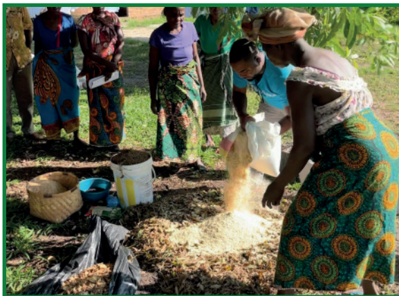
A demonstration of bokashi-making at Dumuwa, near Chintheche, 2023.

The amount of bokashi required for a piece of land depends on the fertility of the soil and the crops to be grown. One experiment on a 10-metre square plot that normally produces just short of 20 kgs of maize – but with bokashi applied produced 30 kgs.