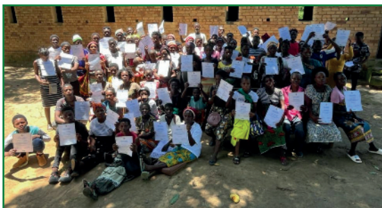
Some of the graduates, proudly displaying their pass certificates.

The ceremony included a funny skit showing how the ability to read means mobile phone messages don't get missed or misconstrued.