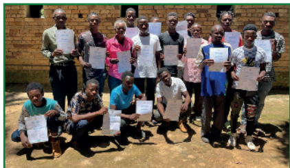
More men are coming to class.

About 20% of the graduates were male. This is significant because there is stigma attached to men who can't read: the Academy teachers, and local leaders, have done well by beginning to overcome that challenge.